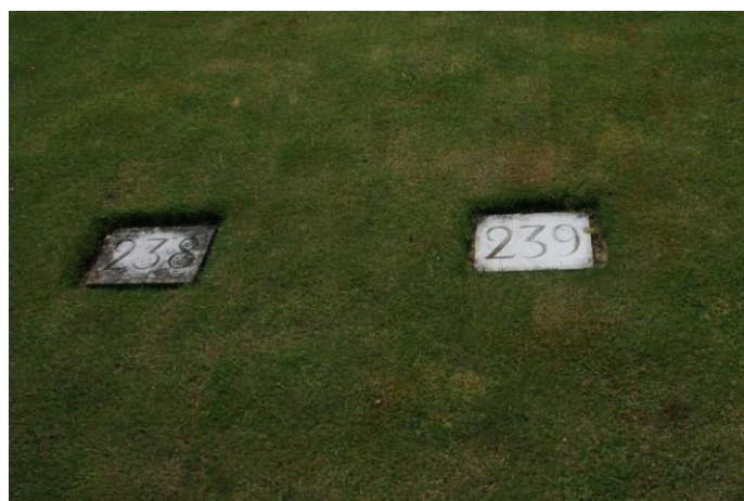
Example showing Pte Cummings in Plot 239 & the Numbered Lawn Plaques in front of Screen Wall