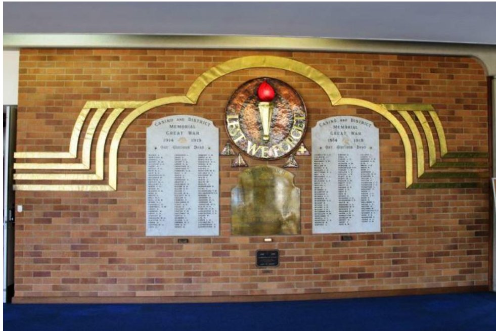
Casino & District Memorial for the Great War 1914 – 1919